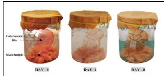
Figure 7.3.10: Colorimetric film quality test on meat sample

study the morphology of the film. The film indicator active response to pH fluctuation was demonstrated through tests on samples of chicken meat under various settings, allowing for the real-time monitoring of spoiled foods. This makes monitoring perishable goods, easy, affordable, environmentally friendly and biodegradable pH-sensitive indicator with visible colour change. The figure 7.3.10 depicts the colorimetric film quality on the meat sample.