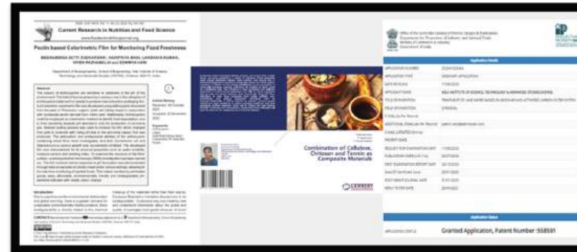
Figure 7.3.6b: Sample Outcomes of the Project developed with In-house facilities