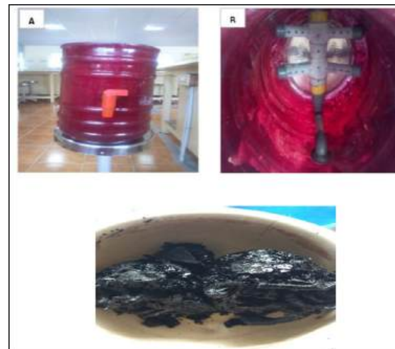
Figure 7.3.7: Water Filter System using Biochar

The home-based biochar has been obtained under slow pyrolysis of neem and jack fruit trees and the activated carbon will be obtained from slow pyrolysis of fruit peels, which holds a commonly porous and stable carbon rich compounds which has the ability in water treatment. Hence, the circumambient 10 products- biochar and activated carbon filtration systems serve as a basic compatible tool in removal of various organic and inorganic pollutants in lake water. According to a new report by WHO and UNICEF 3 in 10 people worldwide, or 2.1 billion, lack access to safe, readily available water at home, the majority of them in developing regions including India. Achieving the sustainable development on ensuring availability and sustainable management of water and sanitation is a major challenge in the regions. So, this contribution aims to demonstrate the 20 biochar and activated carbon filtration system to the low community people for safe and pure drinking water. The figure 7.3.7 depicted the development of Biochar Water Filter system.