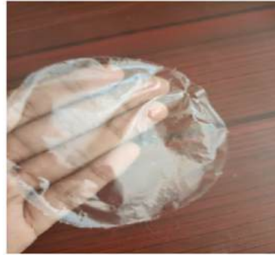
Figure 7.3.8: Cellulose Biofilm developed from Fruit and Vegetable Waste with SCOBY Technology