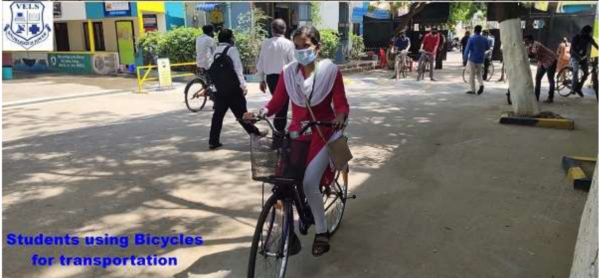
Students using Bicycles for transportation