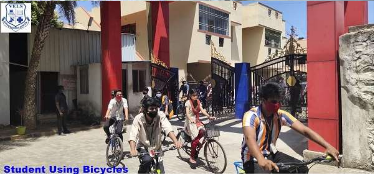
Student Using Bicycles