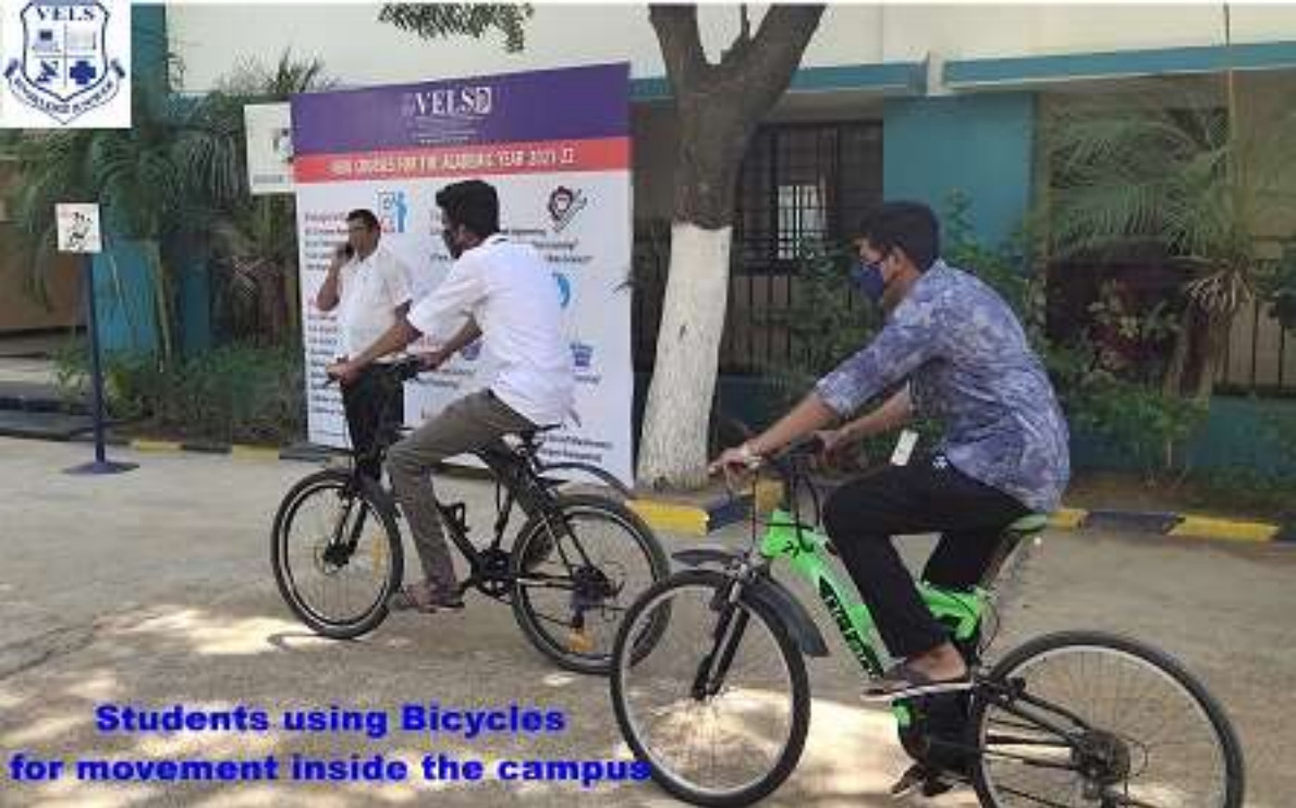
Students using Bicycles for movement inside the campus