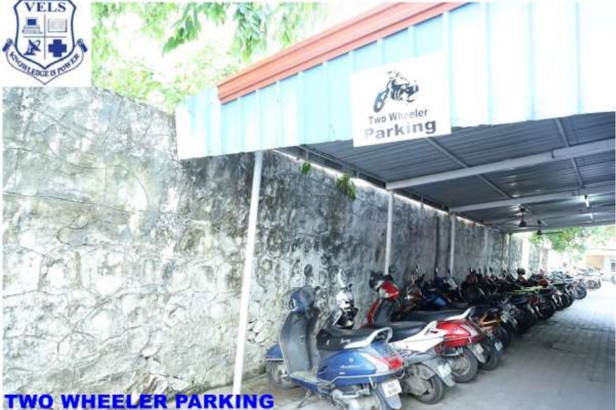
TWO WHEELER PARKING