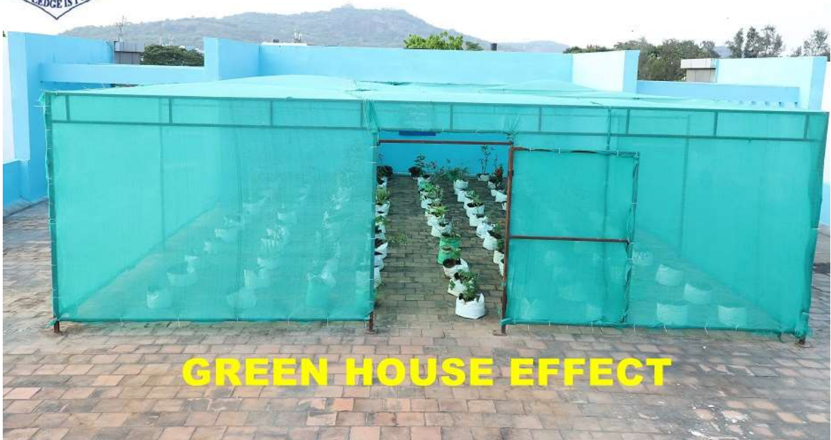
GREEN HOUSE EFFECT