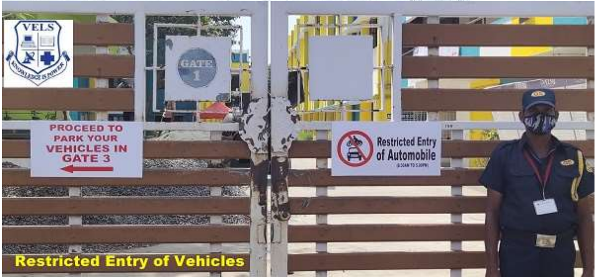
Restricted Entry of Vehicles