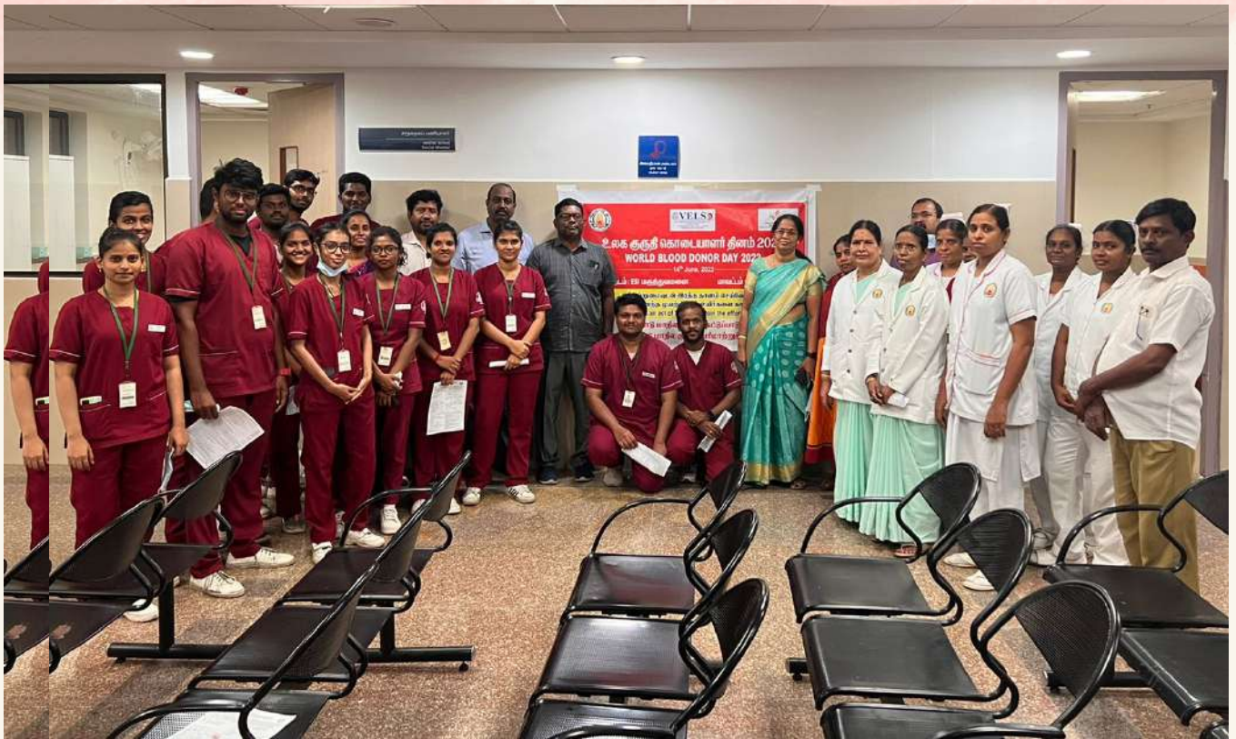
Medical Superintendent, Resident Medical Officer, Matrons, Chief of Blood Bank, Doctors, HOD Department of Pharmacy Practice and Student Volunteers