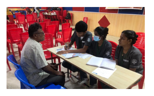
Counseling for Diabetes