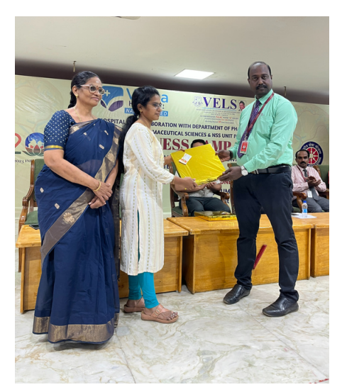
Felicitation of Chief Guests