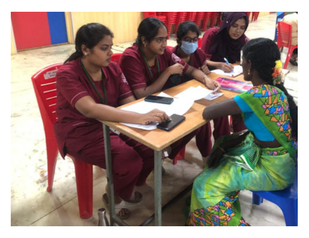
General counseling on basic lifestyle modifications