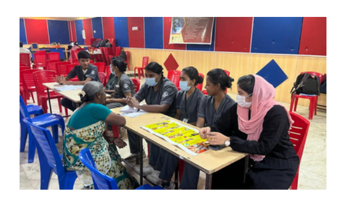
Counseling on Hypertension