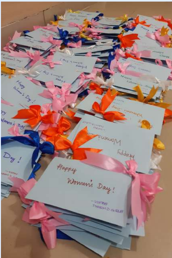
Handmade greeting Cards