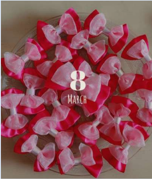
Pretty Pink badges for the Girls