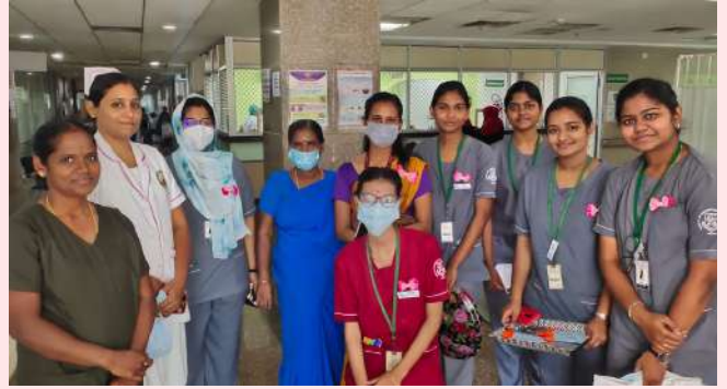
COVID Vaccination Centre