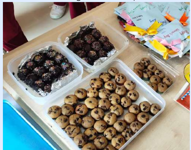
Snack for the day at DIC