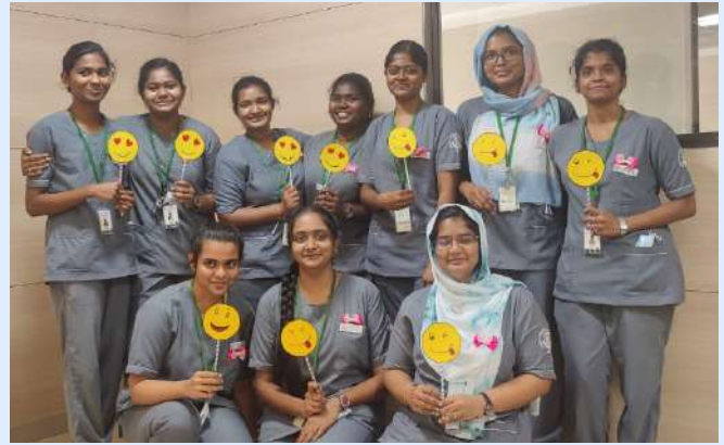
Pharm.D 5th years