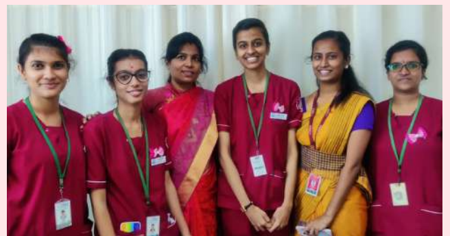
General Medicine OP