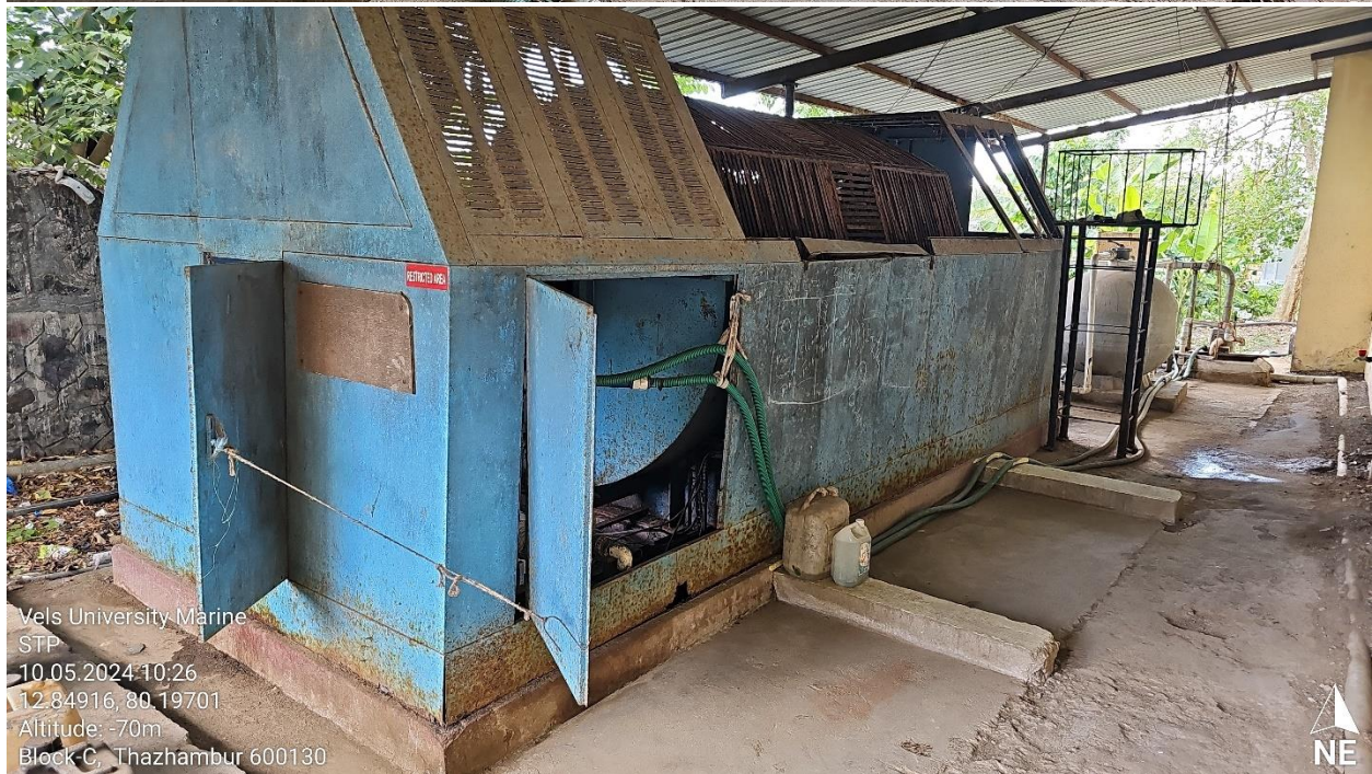
Vels University Marine STP 10.05.2024 10:26 12.84916, 80.19701 Altitude: -70m Block-C, Thazhambur 600130