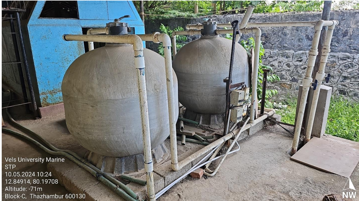
Vels University Marine STP 10.05.2024 10:24 12.84914, 80.19708 Altitude: -71m Block-C, Thazhambur 600130