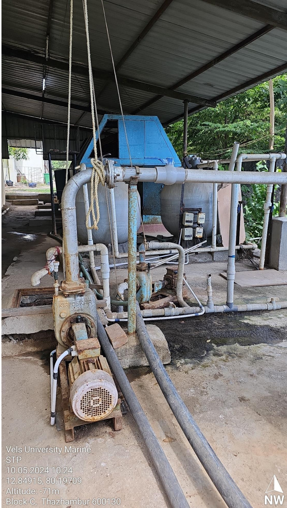
Vels University Marine STP 10.05.2024 10:24 12.84915, 80.19709 Altitude: -71m Block-C, Thazhambur 600130